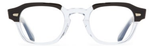
CGOP-1420-47-01 Black on Crystal

Each piece is handmade in our atelier over 270 hours. Available in Black on Crystal, Multi Havana, Havana on Grey, and Grey on Granny Chic.