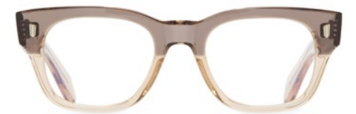
CGOP-1421-50-04 Grey on Granny Chic