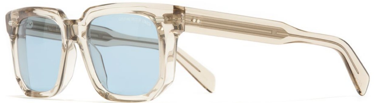
CGSN-1410-54-03 Sand Crystal