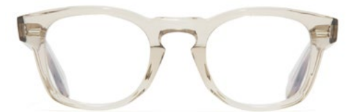
CGOP-9389-54-03 Sand Crystal