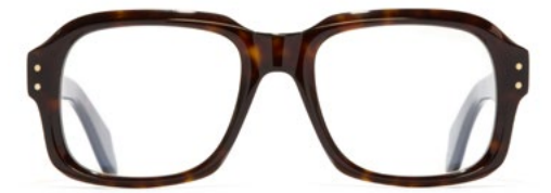
CGOP-9852-52-02 Dark Havana

Each piece is handmade in our atelier over 265 hours. Available in Dark Havana, Deep Blue and Black.