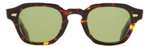
CGSN-1420-47-02 Multi Havana