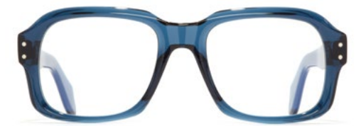
CGOP-9852-52-03 Deep Blue