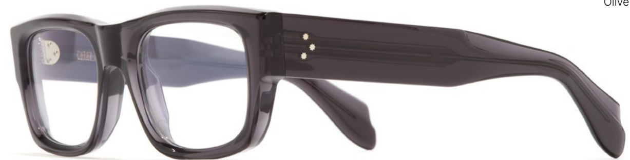
CGOP-9043-53-04 Dark Grey