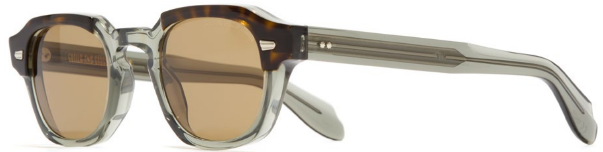
CGSN-1420-47-03 Havana on Grey