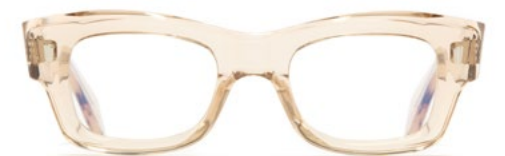
CGOP-1419-48-04 Granny Chic