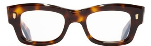
CGOP-1419-48-02 Old Brown Havana