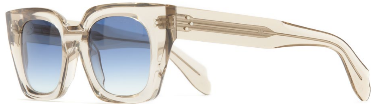
CGSN-1422-50-03 Sand Crystal