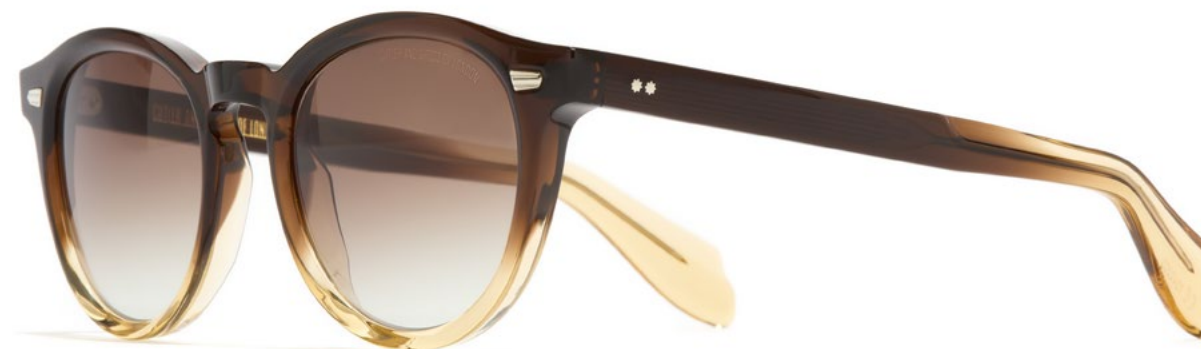
CGSN-9378-50-03 Honeyburst Fade