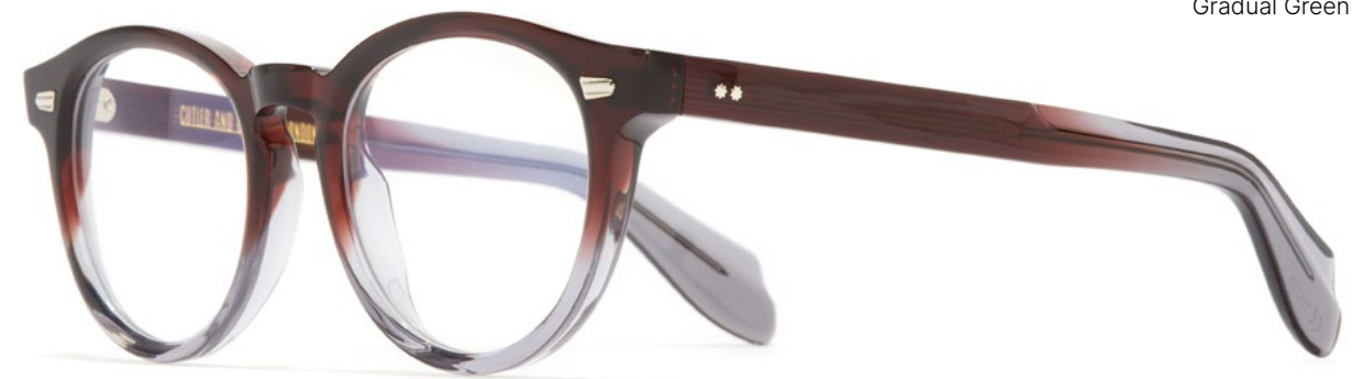
CGOP-9378-48-03 Gradual Sherry