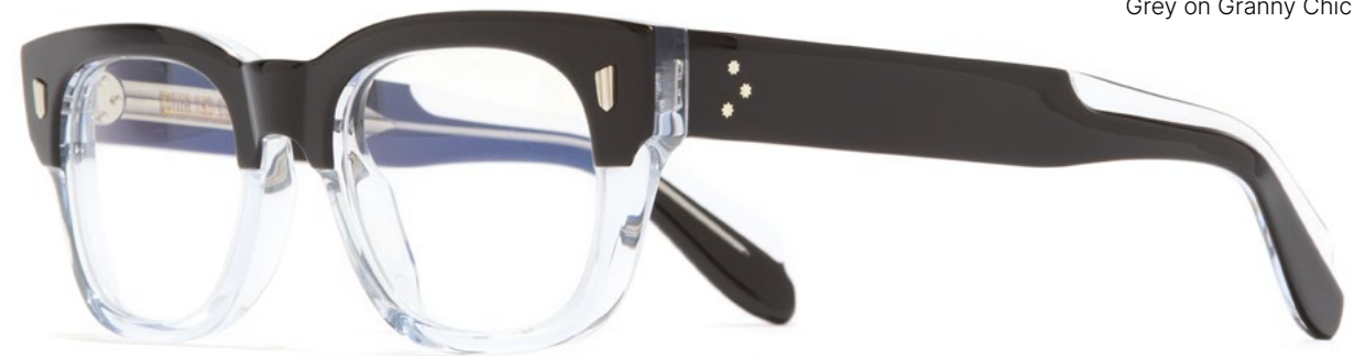
CGOP-1421-50-01 Black on Crystal