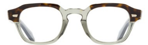
CGOP-1420-47-03 Havana on Grey