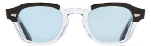
CGSN-1420-47-01 Black on Crystal

A limited production of 350 frames. Available in Black on Crystal, Multi Havana, and Havana on Grey.