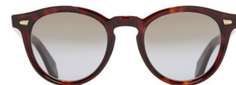
CGSN-9378-50-02 Dark Turtle