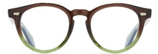
CGOP-9378-48-04 Gradual Green