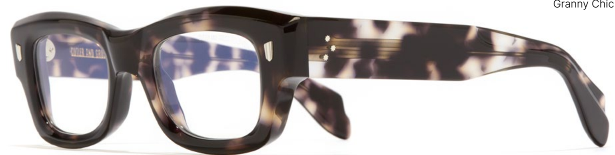
CGOP-1419-48-03 Grey Havana