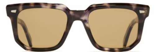
CGSN-1410-54-02 Grey Havana