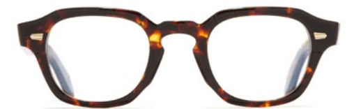
CGOP-1420-47-02 Multi Havana