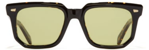
CGSN-1410-54-01 Black on Havana

A limited production of 350 frames. Available in Black on Havana, Grey Havana, and Sand Crystal.