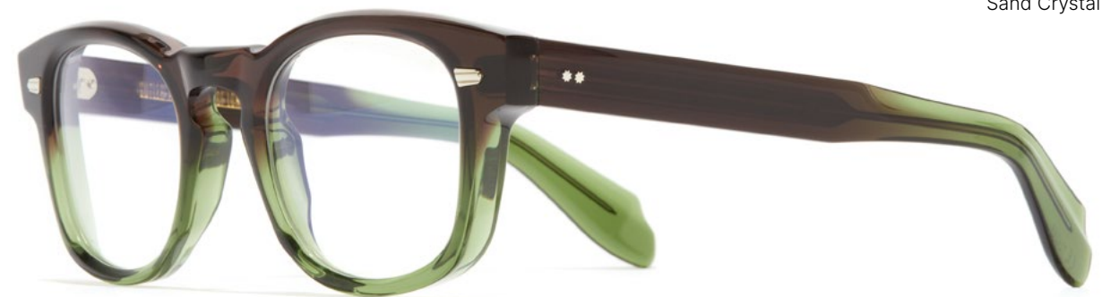
CGOP-9389-54-04 Gradual Green