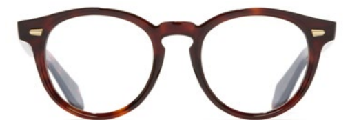
CGOP-9378-48-02 Dark Turtle