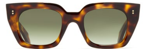
CGSN-1422-50-02 Dark Turtle