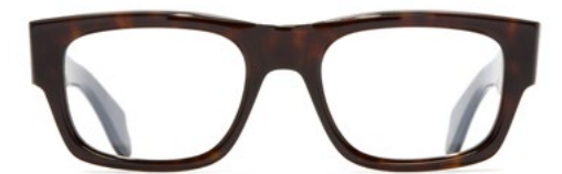
CGOP-9043-53-02 Dark Havana