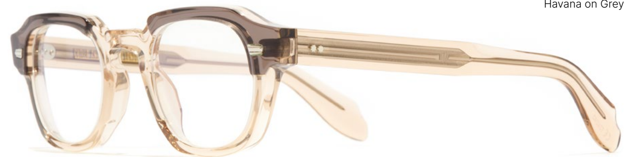
CGOP-1420-47-04 Grey on Granny Chic