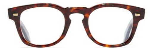
CGOP-9389-54-02 Dark Turtle