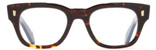
CGOP-1421-50-02 Multi Havana

Each piece is handmade in our atelier over 266 hours. Available in Multi Havana, Horn on Blue, Grey on Granny Chic, and Black on Crystal.