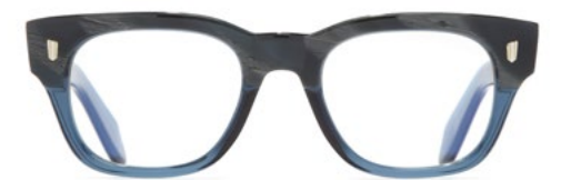
CGOP-1421-50-03 Horn on Blue